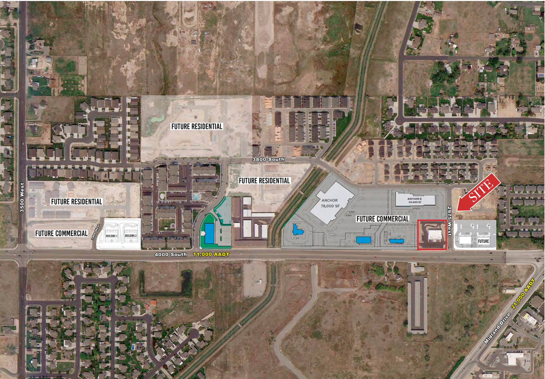
268 apartment units completed, 288 town homes & 112 single family homes planned and under construction